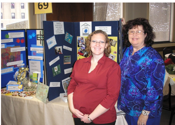
Alternative Gift Market held 12/04/10 at Coe College resulted in $310 contributed to HHM!