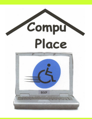
CompuPlace 601 Second Avenue SE #3 Cedar Rapids, Iowa 52401